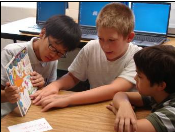
Book Buddies match up experienced readers in upper grades with emerging readers in lower grades. Here we see 5 th grade students reading to a 1 st grader.