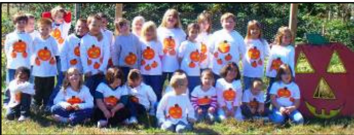
Our Kindergarten classes recently visited the Pumpkin Patch. Each student brought back a prized pumpkin!