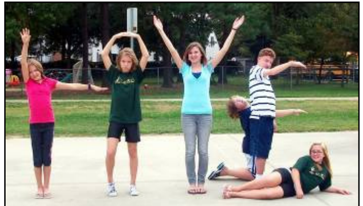
Middle School students, exploring the Fruits of the Spirit, spell one out for us.